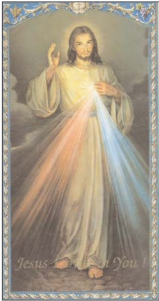
Image of the Divine Mercy

The first Sunday after Easter, April 18, is Divine Mercy Sunday, the day Christ instructed St. Faustina to establish as the Feast of Divine Mercy.