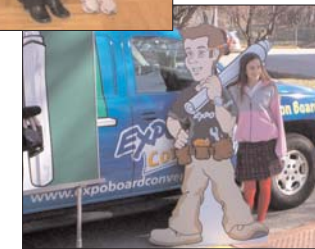
Below: The Expo van arrives at Incarnate Word filled with games, prizes, and gifts.